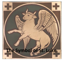
The seal of St. Luke

For nothing will be impossible with God. Luke 1: 37