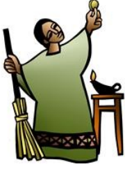
The Woman and the Lost Coin

CALL PROCESS/TRANSITION Dear Lord, be in our intention for the Transition Team as they lay the ground work for the Call Committee. Bless us in dealing with synodical officials, whose job it is to assist congregations in the call process. Bring to us that pastor whom you have chosen to serve us next. In Jesus' name. Amen.