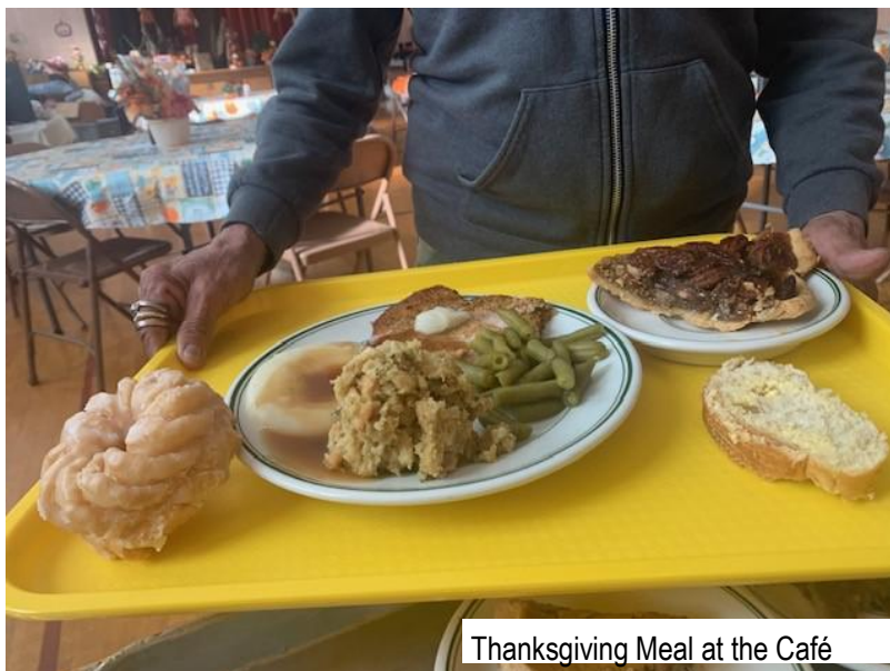
Thanksgiving Meal at the Café