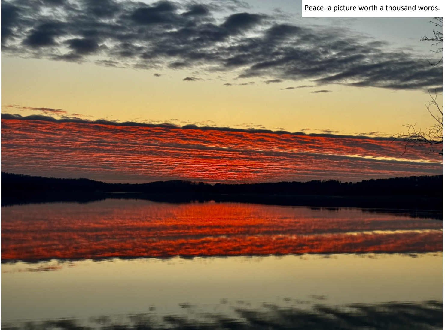
Peace: a picture worth a thousand words.

When we hear the song of the angels this year, let us pray for peace, that the nations will make peace instead of war, that the nations will produce and export implements of peace, not weapons of war. "On earth peace among those whom [God] favors." The appearance of Jesus as Savior of the Nations means that God favors all of humanity and desires that we might know peace, live in peace and have peace deep in our hearts. Join me in making prayers for peace our Advent and Christian prayer intentions this year. Dear Lord, you sent Jesus as the Prince of Peace. Grant that our world may know his peace this year. Bring an end to armed conflict on this earth. Protect those who are in danger because of war. Bring us to that time when we may enjoy peace among all humans, a just and equitable peace that favors none, and so favors all. In Jesus name. Amen.