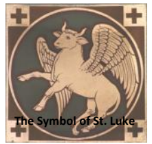
The seal of St. Luke

For nothing will be impossible with God. Luke 1: 37