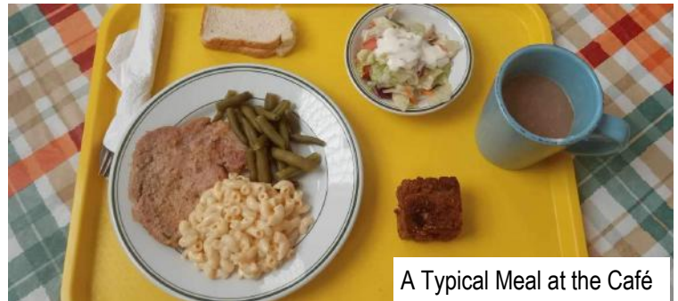
A Typical Meal at the Café

Cindy and the crew dressed up for Halloween (above) At right the Sunday School kids used their Thanksgiving break to come and help serve the Thanksgiving meal day before the holiday.